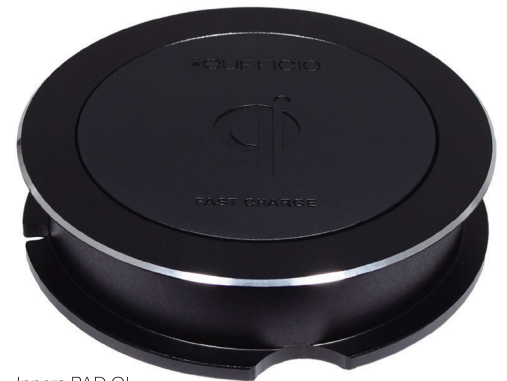
Innera PAD Qi EWC-8010

It is designed to charge easily your Smartphone or any electronic device of 5V and 9V. The new Innera PAD Qi is made of aluminium in black matt finish. It incorporates a threaded fixing system enabling the installation of the charger in any Surface with a maximum thickness of 34 mm.